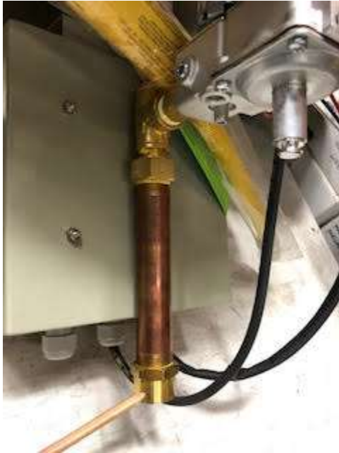
Pointing at the endcap of Condensation Chamber

***Remove the end cap and drain off any water. Install the end cap with fresh Teflon tape and check for gas leak.