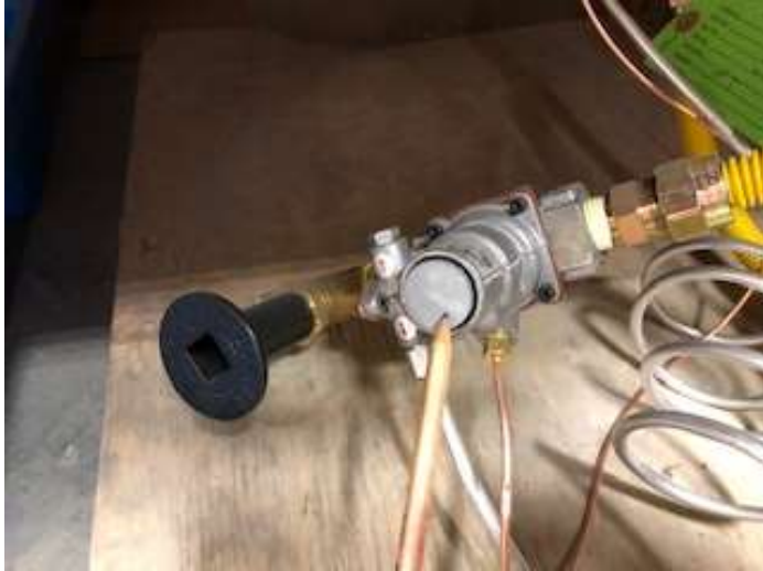
Flame Supervision Valve H15 button (grey in color). Note the pattern on the back of button for reinstallation

Thermocouple K17 – *Gently clean the tip with steel wool to remove tarnish.