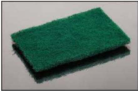
Scotch Brite green buffing pad

Your concrete firepit may slightly fade, patina, and/or watermark over time. This is natural and normal. If you wish to bring it back closer to its original colour it will require a gentle buffing with a clean Scotch Brite green pad (or something similar to what is pictured below) and then a liberal application of stone sealer. (Any stone sealer will suffice including Miracle 511 or a stone sealer from Home Depot, B & Q (UK), or a similar retail store)